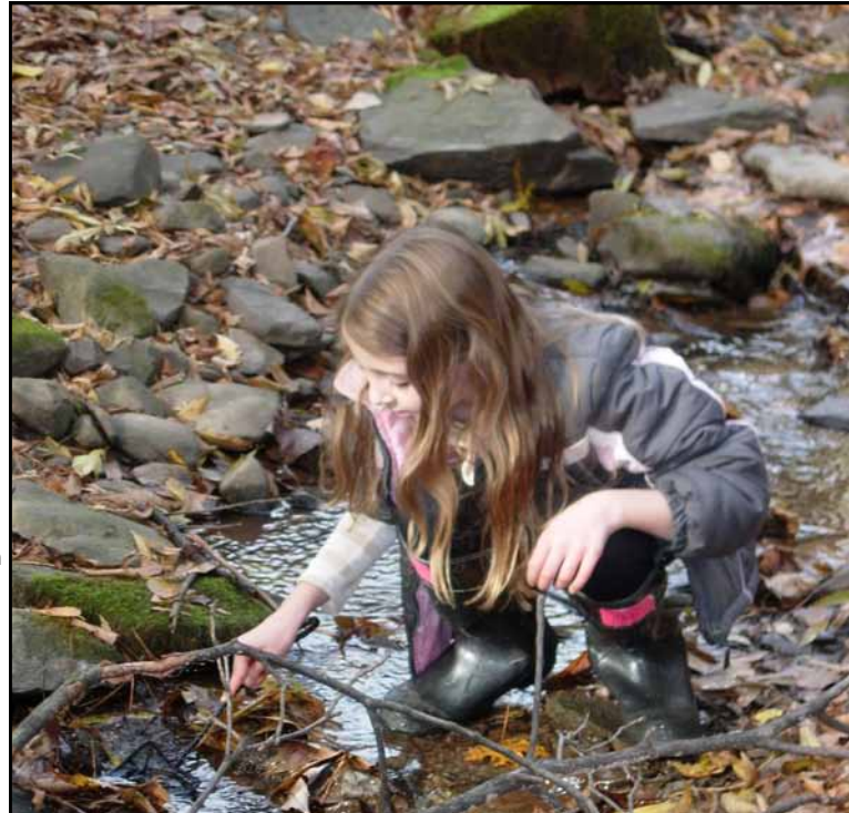
Above: A "Watershed Detective" takes a sample from a stream.

The Watershed Detectives program centers around a core group of ten 4th grade students, with other students cycling in and out periodically. The stream just behind the school is a small, safe area that provides the perfect laboratory for burgeoning scientists. They have run