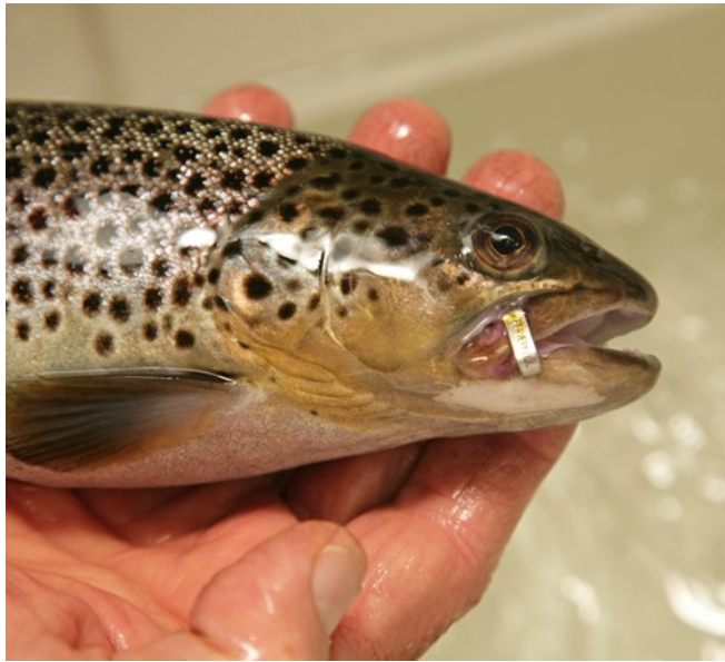
Above: Tagged Brown Trout