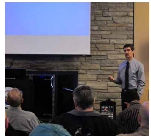
this event please see the article "Research on Brown Trout" on page 5.